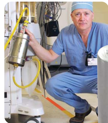
Portable Canister installed in the OR

Install Deltasorb® or Centralsorb™ Anesthetic Collection Service at your hospital, Call (905) 761-1224 or visit www.blue-zone.ca